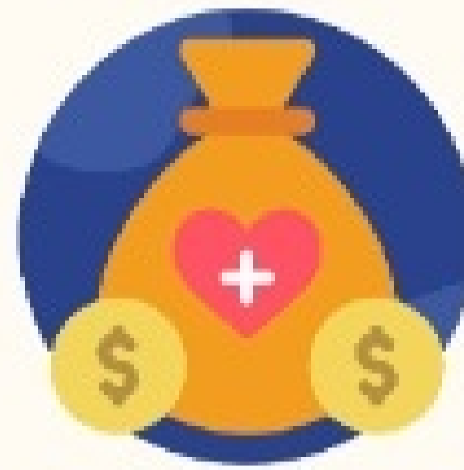
Financial Wellness Licensed Financial Adviser