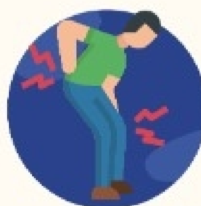
Ergonomics Health Certified Chiropractor Certified Physiologist