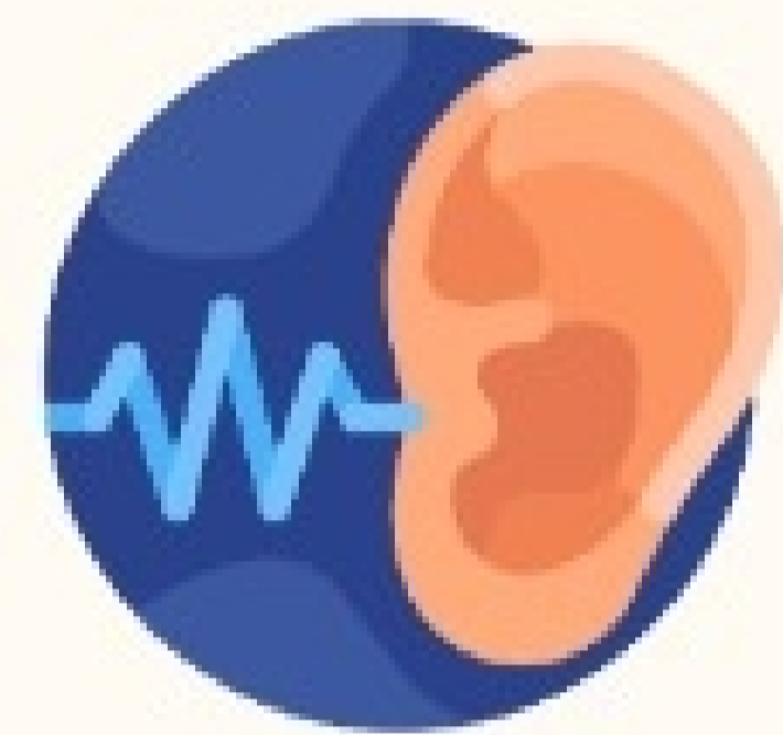
Ear Health Certified Audiologist