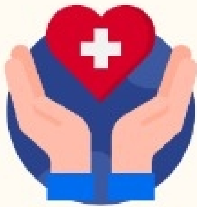
Public Health Medical Doctor