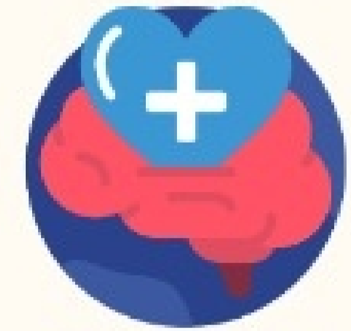
Mental Health Clinical Psychologist