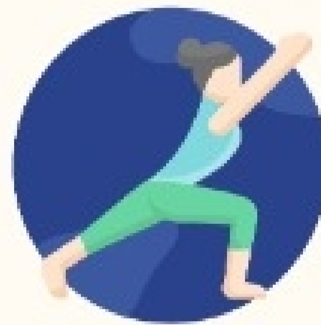
Physical Health Certified Fitness Trainer