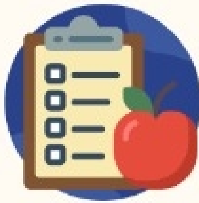
Nutrition Health Certified Dietitian