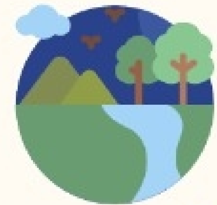
Environmental Health Green Technology Assistant Professor Indoor Farming Specialist