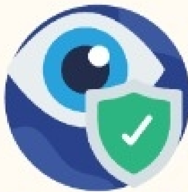
Eye Health Certified Optometrist